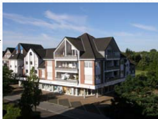
Good address Voerde

The neighborhood of Voerde supplies in numerous shops and offices sufficient goods services for the daily use. All the suppliers are rapidly accessible because of good traffic situation. Everything can be reached within an acceptable walking distance. Carefully organized restaurants offer various international culinary delights. The newly created shopping center of Voerde offers numerous shops that invite for a well-doing shopping spree.