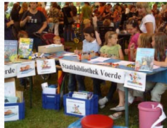
Stand of the city library at the „knightfestival“