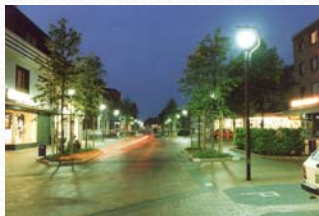
City centre by night