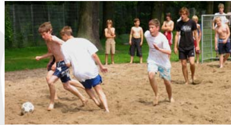
Beach Soccer in the openair bath