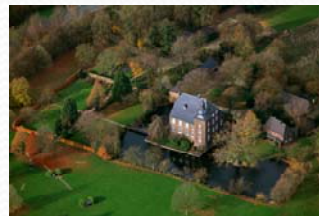
Aerial image of house Wohnung

Voerde is connected by its own railway station to the national highway beginning in Oberhausen and ending in Amsterdam. So that we can guarantee a wide traffic network. The neighboring town Wesel can be reached within 15 minutes by bus, train or car.