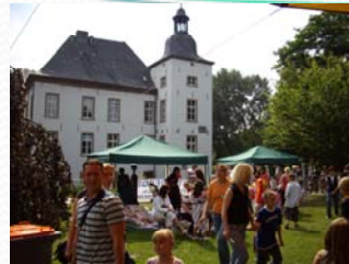
Event at the moated castle