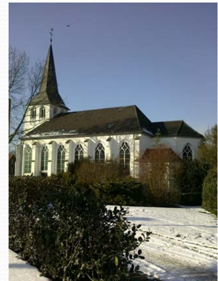
Chuch in Götterswickerhamm

The history of a City is aswell the history of its churches. Lots of essays were written about the church-history of Voerde. Resulting from the big space you can find in Voerde lots of churches partly old or partly more recent. Almost every district has churches for the catholic and evangelic confession or at least parishioners which assimilate harmonical in the cityscape.