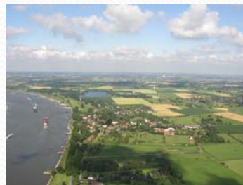
Aerial image of Voerde