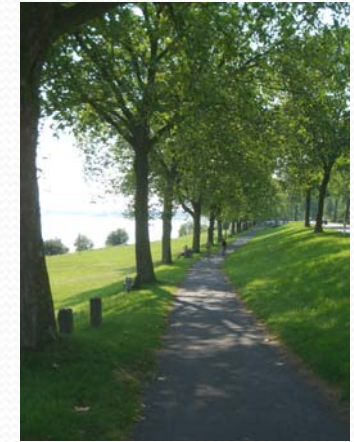
Bicycle path at the Rhine