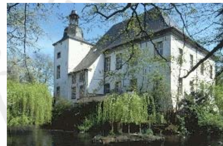
moated castle „house Voerde“

Nobody can escape from the attraction of the moated castle and the appeal grows constantly for guests and as well for the inhabitants. Going a long way towards to it, is the groomed parc and the idyllic picture of the pool with its swans and ducks around the castle.