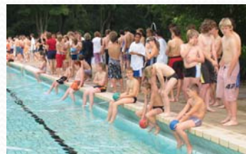
Open-air bath Voerde