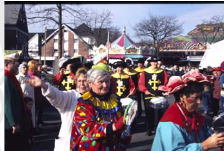
Carnaval parade in Voerde